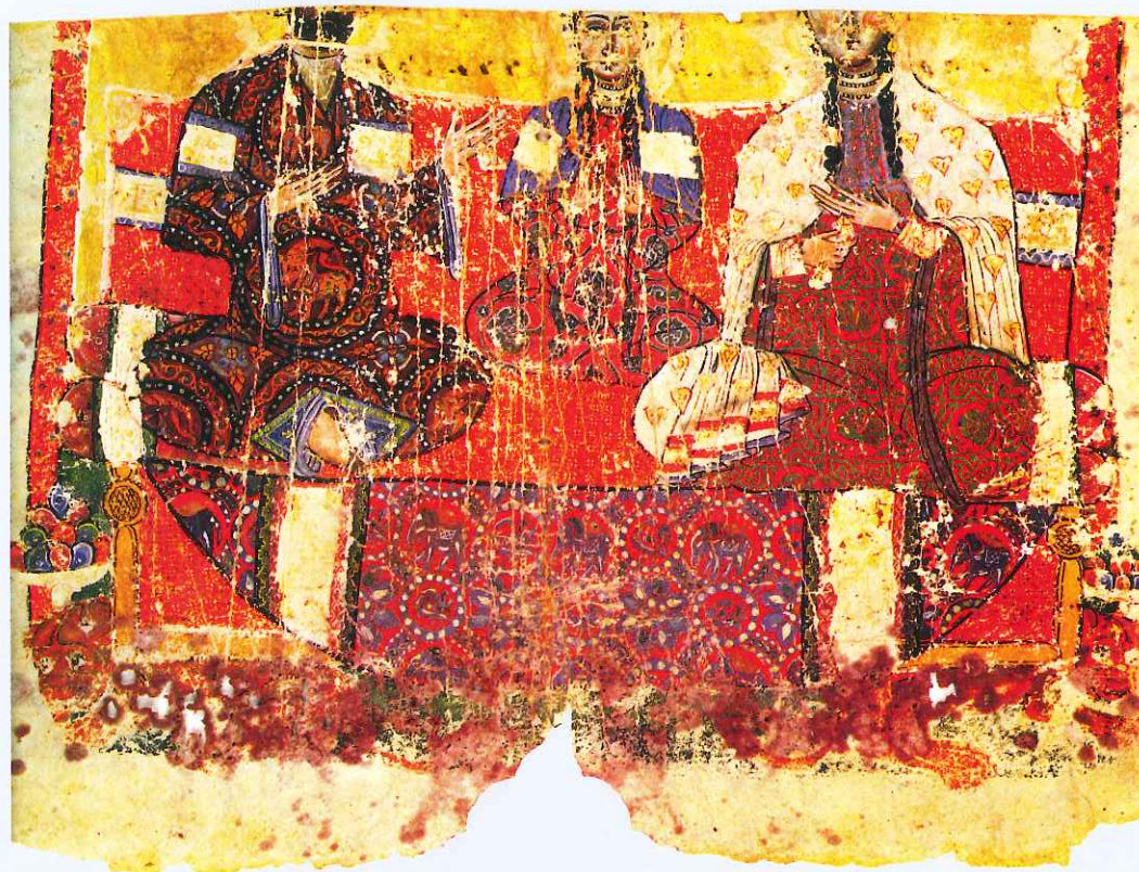
Fig. 12: Royal enthronement scene from the frontispiece of a Gospel commissioned by Gagik Abbas, ruler of Kars ca. 1050 (Armenian Patriarchate, Jerusalem, No. 2556, fol. 35v).