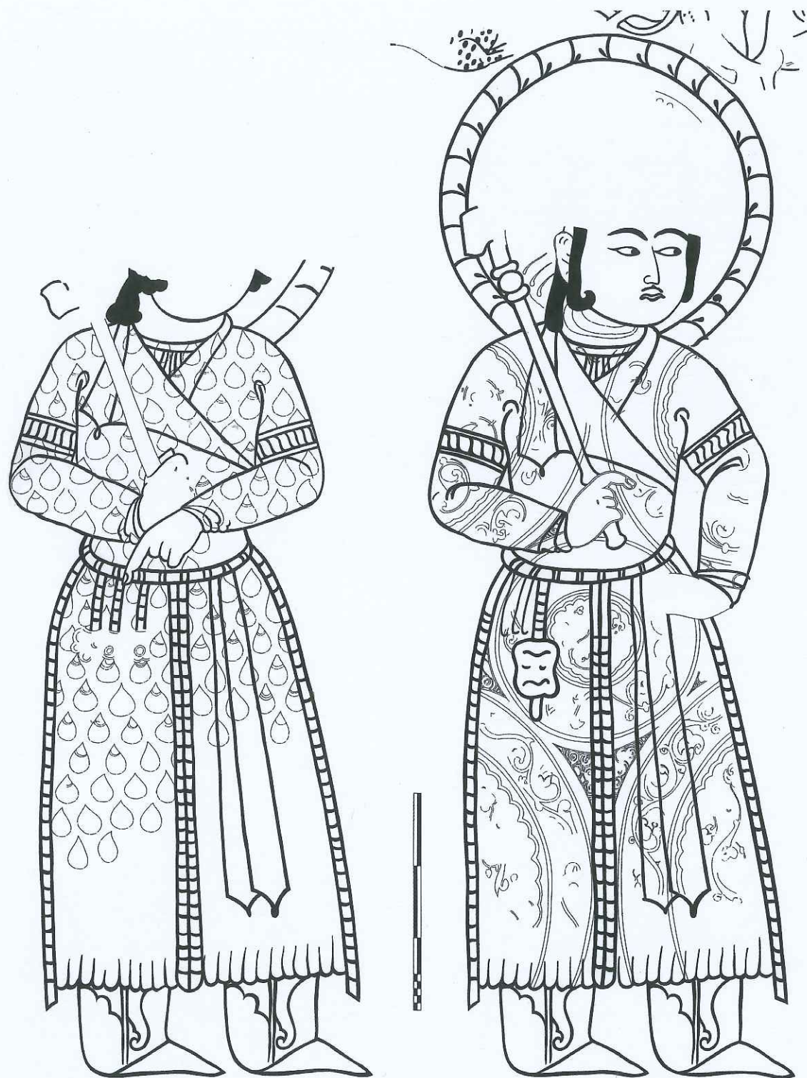
Fig. 14: Turkic ghulāms of the Ghaznavid sultān , drawings after frescoes in the throne-room of the palace at Lashkari Bazaar, Afghanistan, 11 th century (after Schlumberger & Sourdél-Thomine, Lashkari Bazar , 1978).