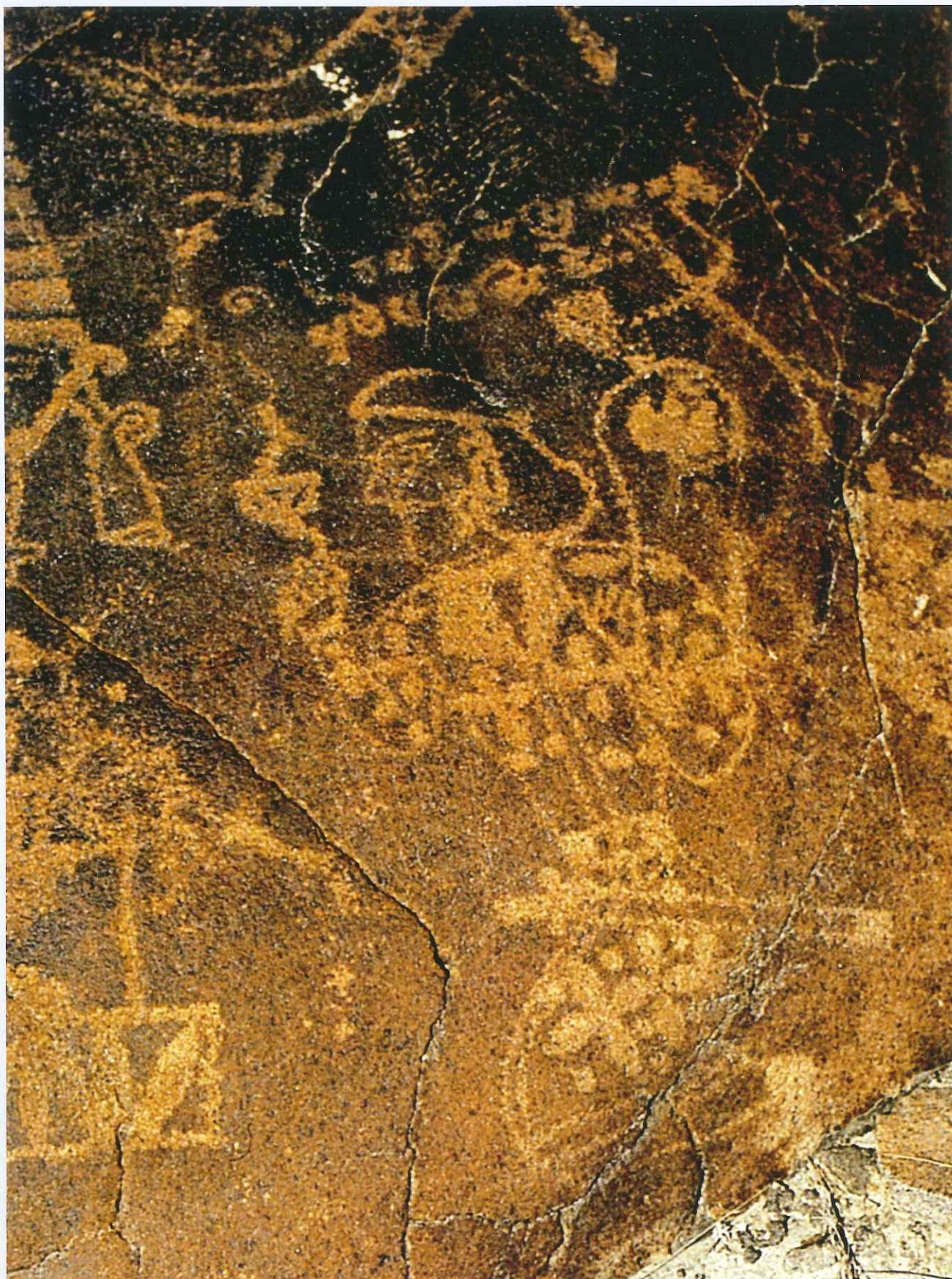
Fig. 13: Veneration of a stūpa, petroglyph, Thalpan-Ziyarat, northern Pakistan, ca. 7 th cent. (after Jettmar, Cultural Heritage of the Northern Regions of Pakistan , 1992).