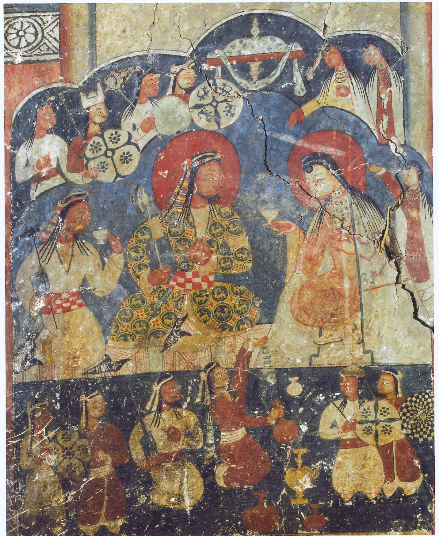
Fig. 5: Royal drinking scene in the Dukhang at Alchi (courtesy of Jaroslav Poncar, 1983).