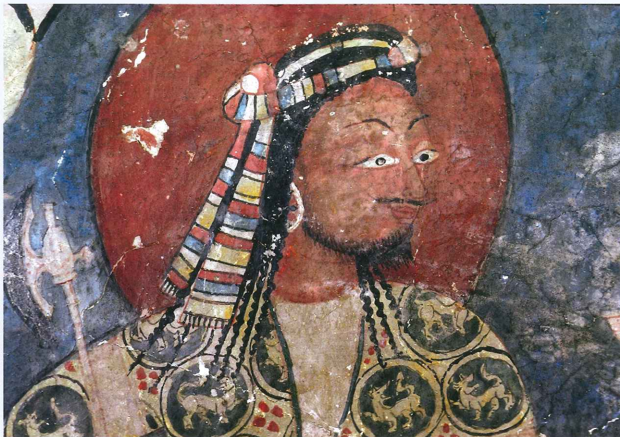
Fig. 5A: Detail of Fig. 5 (courtesy of Jaroslav Poncar, 1983, WHAV JP83 8,420).