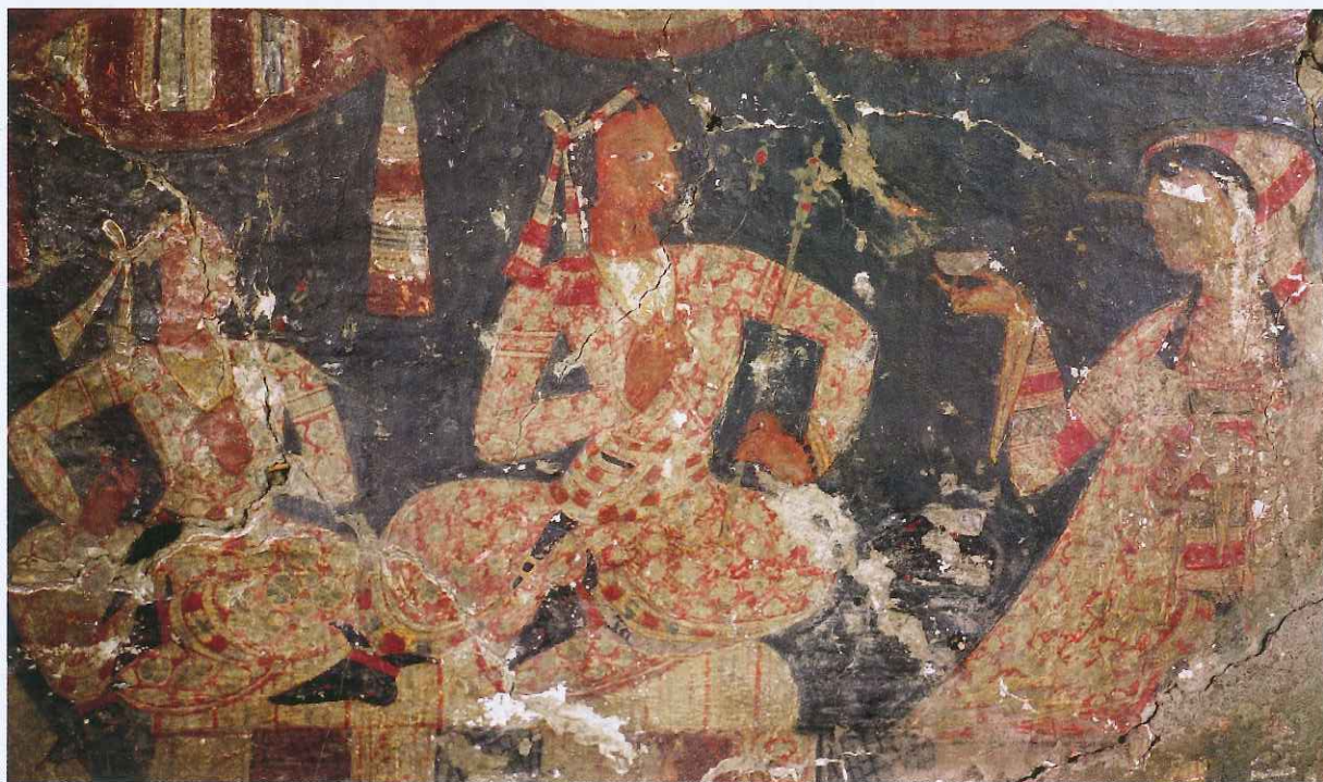
Fig. 6: Royal drinking scene, Mangyu, Ladakh, 11 th or 12 th century (after van Ham, Heavenly Himalayas , 2011).