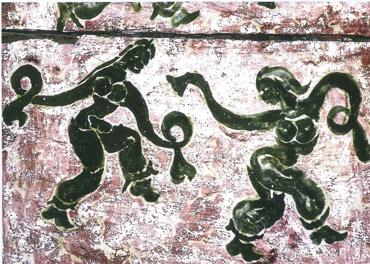
Fig. 1: Dancers depicted on the ceiling of the Sumtsek, Alchi (after Goepper & Poncar, Alchi: Ladakh's Hidden Buddhist Sanctuary , 1996).