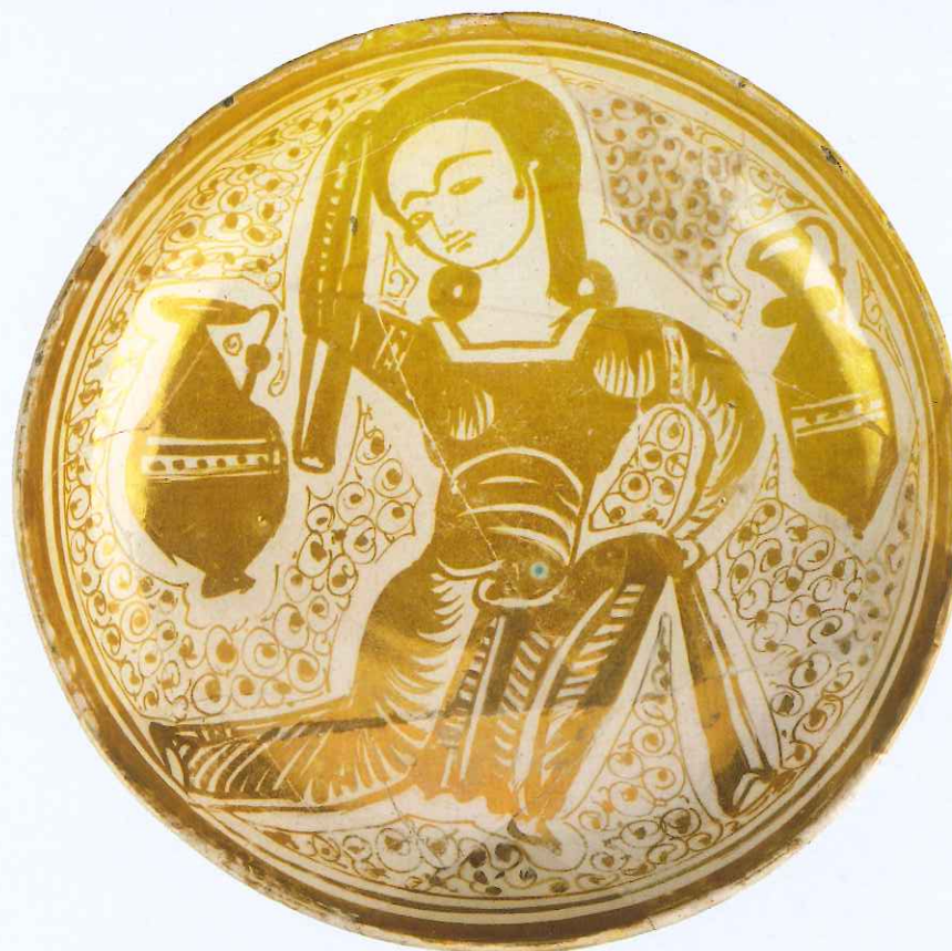
Fig. 2: Dancer depicted on a luster bowl, Fatimid Egypt, 11 th –12 th century (Freer Gallery of Art, Smithsonian Institution, Washington, D.C.: Purchase, F.1946.30).