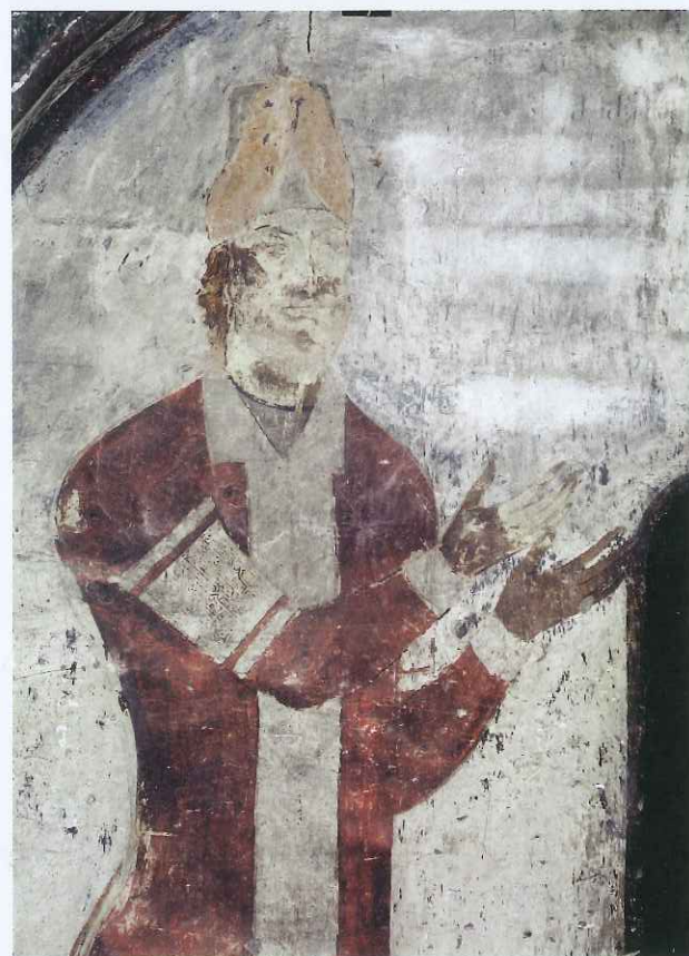
Fig. 19: Rat'i Surameli, duke of Javakheti and Kartli wearing a sharbūsh and front-opening qabā' with ṭirāz bands inscribed in Arabic or pseudo-Arabic using Kufic script, slightly before 1186, Vardzia, southern Georgia (photograph courtesy of G. Chubinashvili National Research Centre for Georgian Art History and Heritage Preservation, Tbilisi, Inv. No. 5246-262).