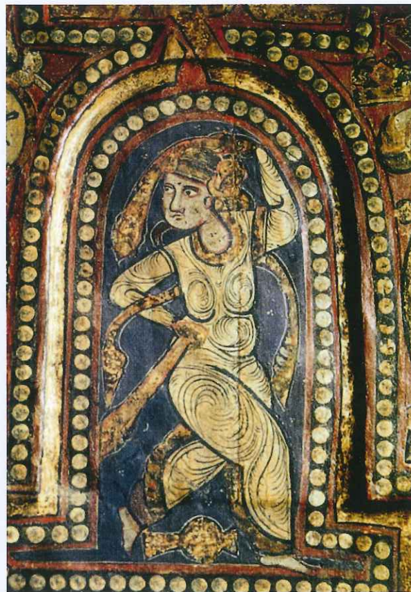
Fig. 3: Dancer depicted on the ceiling of the Capella Palatina, the Palatine chapel of the Norman rulers of Palermo, ca. 1140 (after J. Grube & J. Johns, The Painted Ceilings of the Capella Palatina , 2005).