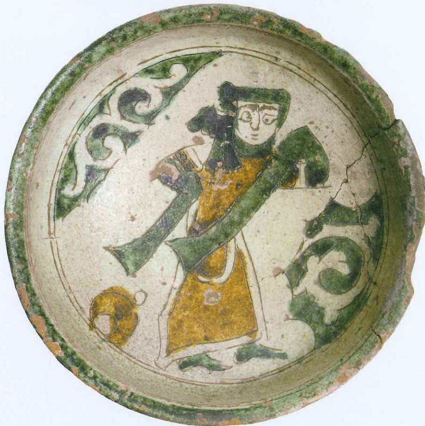
Fig. 4: Sleeve-dancer depicted on a glazed sgraffito bowl, Georgia, 12 th or 13 th century (after Bakhadze et al., Ceramics in Medieval Georgia , 2010).