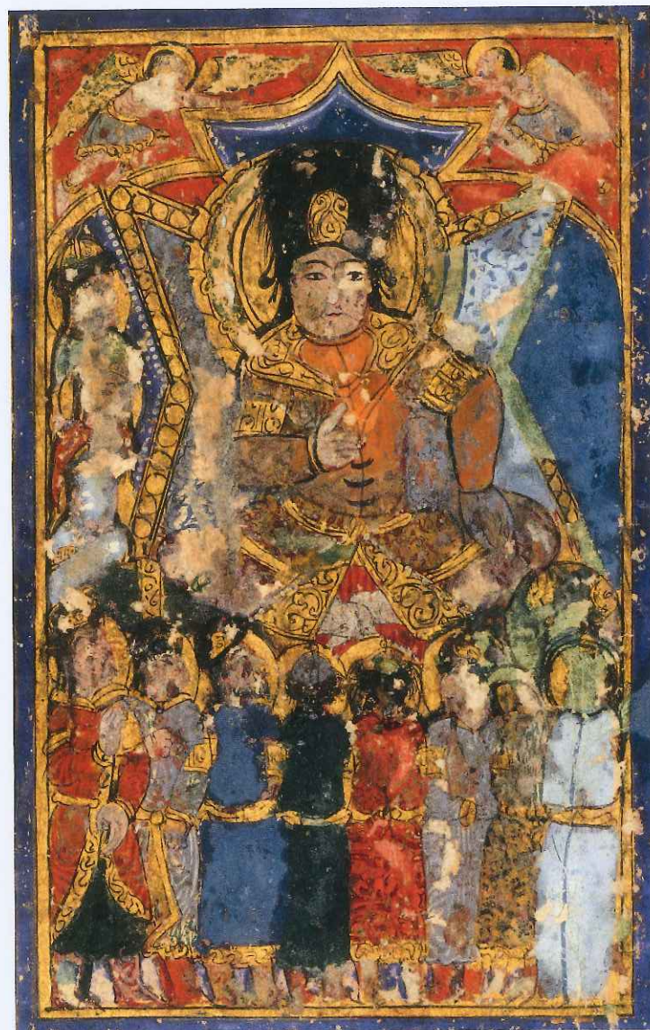
Fig. 15: Double frontispiece to a copy of the Maqāmāt of al-Ḥarīrī, Iraq (probably Baghdad), 1237, depicting on the left a figure in Arab dress and, on the right, a figure wearing Turkic military attire (Bibliothèque nationale de France, arabe 5847, fols. 1v-2r).