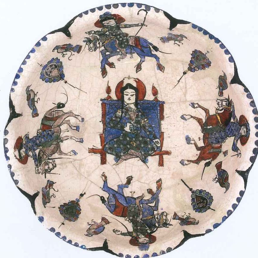
Fig. 11: Mina'i bowl depicting an enthroned figure wearing a qabā' with tirāz bands, Kashan, late 12 th or early 13 th century, diameter 18cm (Museu Calouste Gulbenkian, Lisbon, Inv. 935).